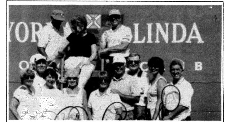
The "racket" squad, better known as the Padre Tennis Tournament participants, get their day in the sun!