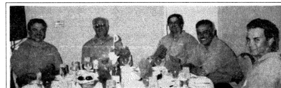
The Lopez "gang" in uniform.